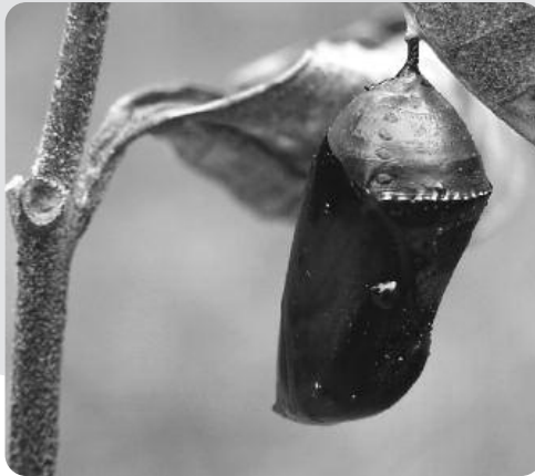
When it's about 2" long, the caterpillar attaches its hind end to a branch, then hangs down and molts for the last time. When the fresh skin dries and hardens, it forms a green chrysalis with a gold rim.