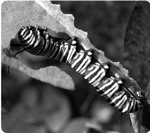
A larva hatches and the black, white, and yellow-striped caterpillar feeds voraciously on milkweed for about two weeks.

To learn more about Monarchs and how to provide habitat, visit www.monarchwatch.org and www.enchantedlearning.com/subjects/butterfly/species/Monarch.shtml .