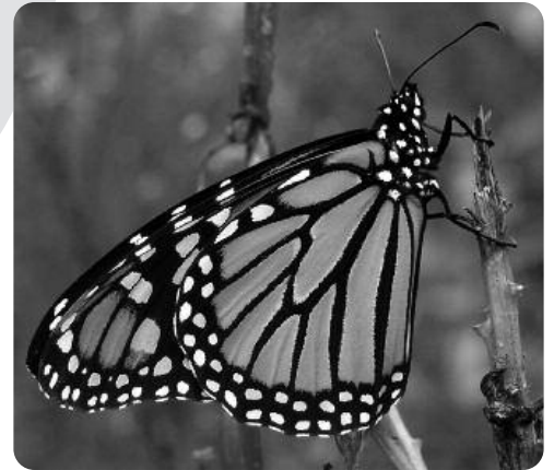
10-12 days later, a butterfly emerges to inflate its wings. It lives for about 2-6 weeks, laying eggs for the next generation.